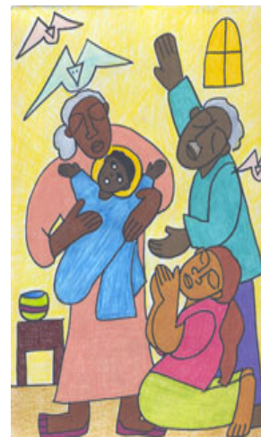
Presentation in the Temple

Illustrations should be clearly related to specific scenes or portions of the reading. Their presentation, whether in a scroll or one by one, should be timed to coincide exactly with "their portion" of the reading being read. You must show each illustration long enough for everyone to see it adequately; this may require some tricky "orchestration" with the reading. Once you have illustrations you like, save them. They can always be put to new uses.